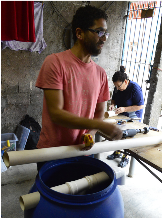
Figure 2: Members of one of São Paulo's housing movements, building rainwater capture cisterns in a favela in the city's Eastern Zone.

of environmental activists called Cisterns Now! They would later travel to New Palestine to help build cisterns there. And their technique was also used in some downtown building occupations of the type referred to above in Section 3. The mutual learning exemplified a broader process during the water crisis whereby environmentalists and housing movement organizers, long mutually estranged, began to cooperate. In doing so, however, they focused exclusively on water, negotiated a new dialogue about housing, but largely left root causes of the water crisis to the side.