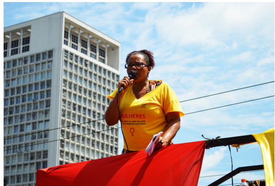
Figure 1: Like housing movements around the world, São Paulo's is primarily composed of, and led by, women of color.

Then, in the fall of 2012, Fernando Haddad, the center-left mayoral candidate of the Workers' Party, won the mayoral election, thanks in large part to strong support from the city's housing movements. Haddad