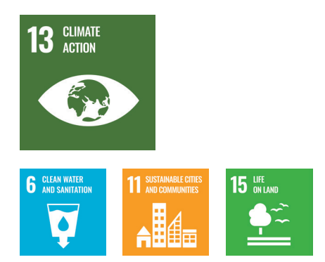
Breda, Netherlands Green Quays Riparian Restoration

Projects like Cape Town's Western Cape Industrial Symbiosis Program (WISP) also demonstrate the continuing need to accelerate city-tocity knowledge sharing and value of multi-sector collaboration. Cape Town adapted a formal economic model from the UK into one that builds a network that includes informal members. This iterative innovation can now be used and adapted by other cities with similar informal economies.