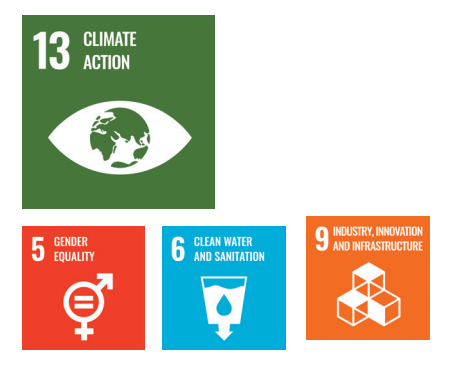
Berhampur, India Faecal Sludge and Septage Management (FSSM) Regulations

Historically, the city has not had an underground sewer system and the toilets are connected to septic tanks. In India, where states hold considerable power over urban development, Berhampur Municipal Corporation took an innovative approach to a public health and environmental problem by partnering with local activists. By working with and enhancing the incomes of the collectives, Berhampur is ensuring sustained community participation and ownership for sustainable sanitation proactices and promoting women empowerment.