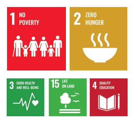
Antananarivo, Madagascar Improving Local Agricultural Systems and Increasing Food Security

With 80% of children in extreme poverty, the city took a multi-sector holistic apporach to reducing malnutrition. Antananarivo has taken a 3-part approach to its food system, with a mobile app ('Mamboly Aho', or 'I Farm') to share urban farming knowledge with and among community members, the 'Better Food for Kids' program, which installs vegetable gardens in schools, and its participation in the Milan Urban Food Policy Pact, through which it monitors its performance on food policy-making processes.