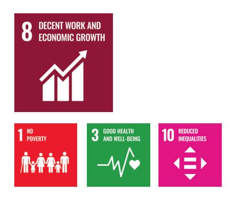
Odisha, India Urban Wage Employment Initiative

Green Square is anticipated to become Australia's largest urban renewal initiative to date, to be supported by participating public and non-public stakeholders with the aim of being the most liveable, resilient, lively, walkable, accessible, sustainable and unique area of the city for the benefit of an estimated 61,000 residents.