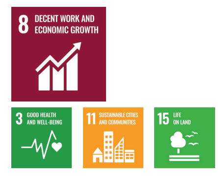
Sydney, Australia Green Square Urban Renewal

Green Square is anticipated to become Australia's largest urban renewal initiative to date, to be supported by participating public and non-public stakeholders with the aim of being the most liveable, resilient, lively, walkable, accessible, sustainable and unique area of the city for the benefit of an estimated 61,000 residents.