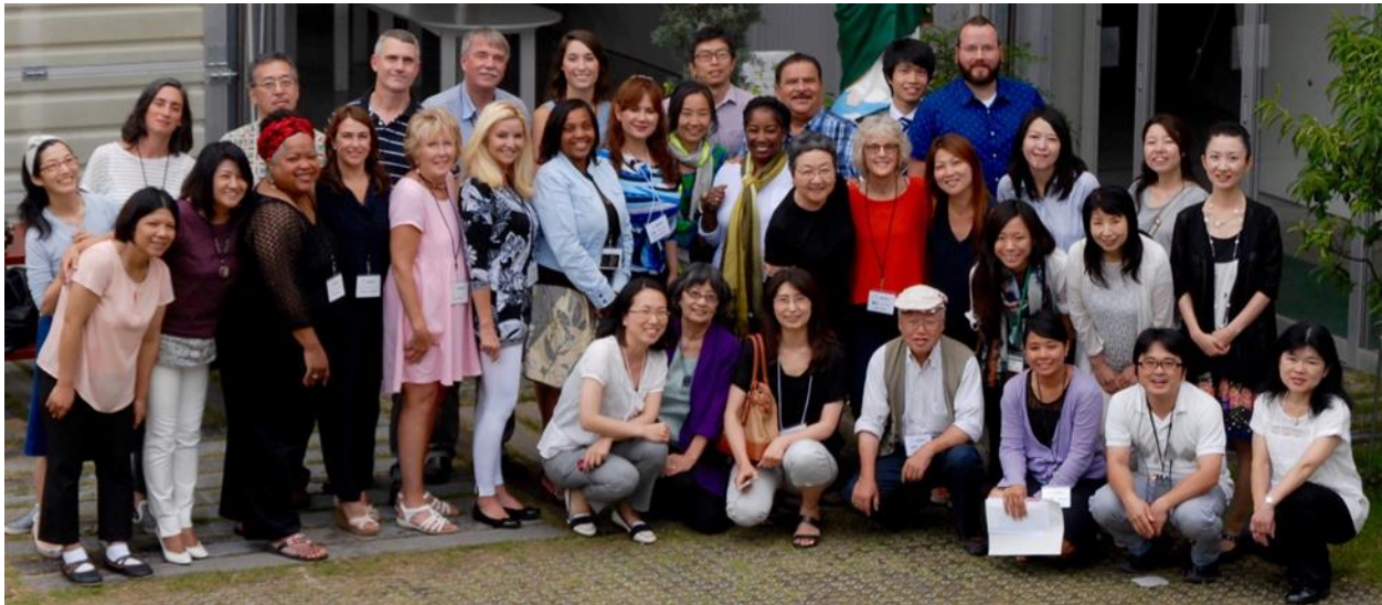
U.S. and Japanese participants gather together at the Takatori Community Center in Kobe, Japan.

The U.S.-Japan Grassroots Exchange Program, “Citizen Participation in Community Building Post-Disaster,” is a three-year program that examines how four cities in the United States and Japan have engaged their local citizens in the long-term recovery and rebuilding of their cities in the aftermath of natural disasters. Throughout the program, a total of 20 U.S. and Japanese participants from New Orleans, Louisiana; Galveston, Texas; Miyako, Iwate Prefecture; and Kobe, Hyogo Prefecture, will have many opportunities to share experiences, ideas, strategies, and visions for rebuilding their communities. In exchange visits to each city, the participants will take part in small group meetings, social gatherings, and other activities where they will discuss challenges, successes, and lessons learned from their efforts to address a wide range of recovery and rebuilding issues including housing, economic development, land use, safety and hazard mitigation, environment, health, and social and physical infrastructure needs of poor and aging populations. The program is funded by the Japan Foundation Center for Global Partnership and the East-West Center.