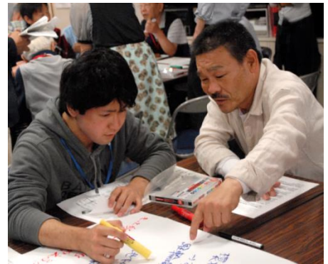
Brainstorming new ideas for neighborhood development in Mano.

Community-based planning can play a critical role in expediting the recovery process and contributing to resiliency. In the context of post-disaster rebuilding, many communities feel that the recovery plans created continue to ignore disparities in services and infrastructure that existed before the natural disaster event occurred, and saw such an event as an opportunity to reform and rebuild in a way that can resolve such issues. Because community members can identify the specific needs and priorities of their neighbors better than government officials, their input is invaluable in developing recovery plans. More importantly, the successful implementation of a recovery plan requires the support of community members. If a government entity creates a recovery plan that does not adequately address the community's goals, then it will face resistance and gridlock, slowing the recovery process. New Orleans faced such an issue after Hurricane Katrina and consequently developed and discarded multiple recovery plans.