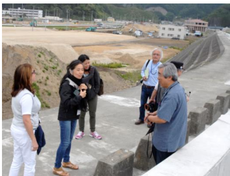
Standing on the Taro seawall.

Controversy still surrounds the rebuilding of the Taro sea wall that was damaged by the tsunami, through construction is already underway in part of the port. Many residents of the area felt it necessary to rebuild the wall higher than before to protect the homes still located near the port. While the vice director of the Taro-Chan Cooperative Association supports rebuilding the sea wall, he is concerned about the negative impact of the higher sea walls on the local fishery. Not only does the