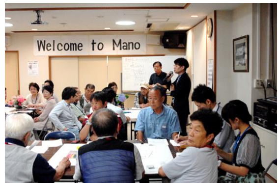
Mano-Machizukuri District Council monthly meeting.