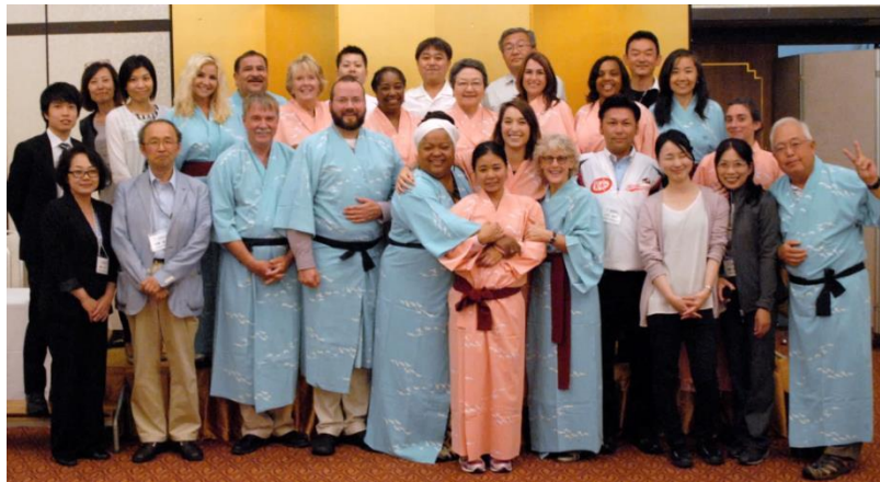
U.S. and Japanese participants after a community dinner at the Jodogahama Park Hotel in Miyako.