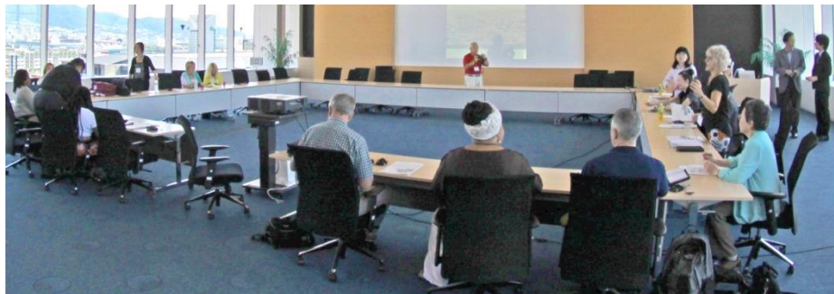
Discussing the roles of local government, the business community, and residents in the recovery and reconstruction of Kobe after the earthquake.

In Kobe, the U.S. delegates met with local leaders, town planners, and activist citizens in a series of vibrant exchanges, coupled with walking tours of neighborhoods and NPOs. These interactions gave delegates a wide array of knowledge about the various phases of recovery that Kobe underwent since 1995 to become the thriving, resilient city it is today.