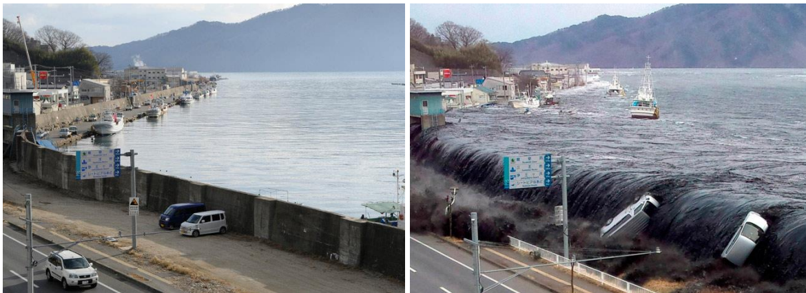
Before and after photos of Miyako City (left); A wave from the Great East Japan Tsunami crashing over a sea wall (right).

Miyako suffered tremendous damage in 2011 due primarily to its proximity to the ocean and the tidal surge. The 9.0 magnitude earthquake was the largest measured earthquake in Japan’s history and the fourth largest globally. The tsunami wave it caused reached a record-breaking 128 feet (39 meters).