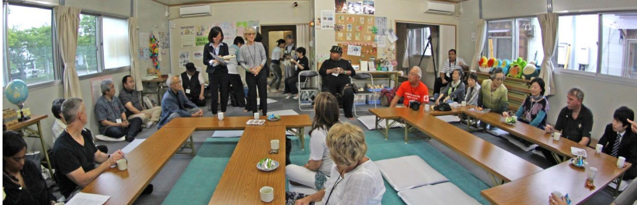
At a tea gathering at the community center of Greenpia Sanriku Miyako temporary housing facility, Taro District residents share their disaster recovery experiences with US participants.

From June 22 through July 1, 2015 ten U.S. delegates from New Orleans and Galveston, accompanied by seven program partners from the United States, Japan, and Canada, traveled to Japan to meet residents and local leaders in Miyako and Kobe. The delegates brought with them a unique and diverse array of experiences with two major U.S. natural disasters: the 2005 Hurricane Katrina and the 2008 Hurricane Ike. They were eager to learn from their Japanese counterparts who experienced major disasters in their own cities: the 2011 Great East Japan Earthquake and Tsunami and the 1995 Great Hanshin-Awaji Earthquake. All delegates from both countries hold a variety of important positions in the community, in business, and in city government. Each delegate experienced disaster differently, and each faced an individualized recovery process. Each city is currently in a different stage of recovery (the disaster events having occurred 20, 10, seven, and four years ago). Such unique experiences with the long-term recovery process allowed for all 20 delegates from New Orleans, Galveston, Kobe, and Miyako to share their current successes and failures and to brainstorm together how community-based groups can help support the recovery process at the grassroots level.