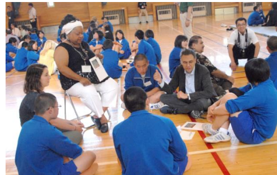
The community coordinator of New Orleans Public Education Network talks with students from Omoe Junior High School about sustainable and resilient communities of the future.

In Miyako, the U.S. delegates from New Orleans and Galveston engaged in discussions with a diverse array of local citizens and leaders. Their exchanges, coupled with site visits, gave them a deep understanding of not only the devastating impacts of the 2011 Great East Japan Earthquake and Tsunami, but also of the abilities of the community members to recover and thrive.