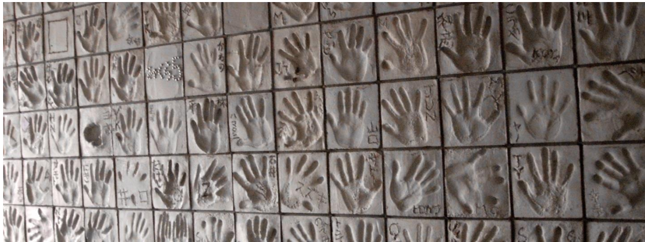
A concrete wall of a Mikura neighborhood community center in Kobe memorializes the collaborative efforts of residents to rebuild the structure after the earthquake.

percent burned in the week after the earthquake. The community took over 10 years to rebuild. It has actively promoted disaster education programs for school students, disaster managers, government officials, and individuals nationally and internationally in order to enlighten groups worldwide about its struggles. The extreme devastation the community suffered in the wake of the 1995 earthquake brought together the small district of 700 people to become a shining star in local, national, and international disaster recovery and preparedness.