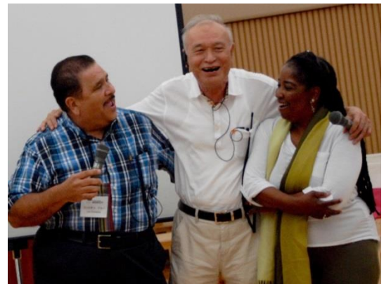
Gulf Coast Interfaith and Saint Vincent's House officials from Galveston share a light moment with the director of Machi-Communication NPO in Kobe.

Miyako and Kobe cities demonstrated a diverse array of important lessons for disaster recovery and resilience at the grassroots level that apply universally. From an infrastructure perspective, the reinstatement of basic services, like water, electricity, and transportation, proves fundamental to the rehabilitation of communities and business. Cooperation among different sectors—government, business, religious—also catalyzes the recovery process. Though complicated and often situational, addressing housing needs must be foremost in recovery plans. Expediting the shift from temporary to permanent housing can most easily restore a sense of community and stimulate economic activity. Until residents can be removed from a transitory state, they cannot move on from their disaster experience. Socially, grassroots organizations play a fundamental role in the mental and emotional rehabilitation of residents. They provide communication tools, physical supplies, emotional support, and a sense of empowerment that comes from commiseration. Such organizations often focus on youth invigoration and education, passing down lessons and experiences, while fostering innovation and continued