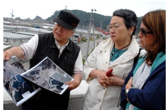
Director of Tachiagaru zo! Miyako-shi Taro NPO (Stand Up Taro!) discusses plans to rebuild the seawall with officials from the Urban Community Research Center for Asia and the New Orleans Chamber of Commerce.

Community-based planning can mean many things but, fundamentally, refers to face-to-face groups within communities addressing the needs of their own communities by thinking about and identifying goods and services needed, developing initiatives and plans to address such needs, and taking steps to execute such plans. 1 Community-based planning has been a popular topic of discussion in planning literature for many years now and has taken on many different definitions as the concept as evolved. Community-based planning arose in response to the top-down planning approaches that may not accurately take into account the true needs of a community and that can ultimately alienate certain populations and increase disparities. Unlike top-down planning, community-based planning is not a single, hierarchical planning structure. Rather, it involves many simultaneous planning activities incorporating the expertise of diverse existing agencies, nongovernmental organizations, private firms, and individuals, and recognizes their relationships and interactions with others. 2