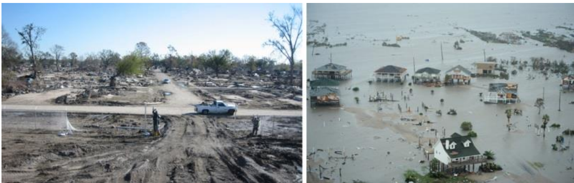
Levee failure, lower 9 th Ward of New Orleans and destroyed homes along the Galveston shoreline.

In contrast, both Hurricane Katrina and Hurricane Ike were relatively slow-moving and long-lasting disasters. Media broadcasted Hurricane Katrina evacuation warnings for days leading up to the event. The event itself brought severe rain and winds for days and caused the levees to break, flooding the city for weeks. Standing water remained in many parts of New Orleans for more than a month. Many residents who were unable to, or chose not to, evacuate were stranded inside the city for weeks, without aid or relief, due to overburdened rescue services. Those who did evacuate were not allowed to return to the city for over a month. Similarly, Hurricane Ike was spotted by weather services days before it reached the Gulf Coast. Residents had days to evacuate to nearby cities. When the Hurricane hit Galveston, the city was inundated with rain and winds for more than 24 hours. Though high winds damaged the city, the seawall (built in 1902) protected the island from initial storm surges. The majority of damages occurred when the hurricane continued inland and caused heavy rains to flood nearby Galveston Bay. This water flushed back into the ocean, making Galveston vulnerable to flash flooding that left standing water for over a week.