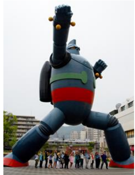
Tetsujin 28 symbolizes the reconstruction of Kobe after the earthquake and commemorates the city's reawakening.