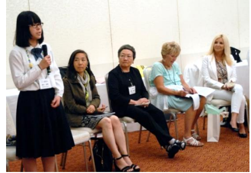
A Miyako high school student and member of Youth Miyakkobase NPO shares her ideas for community recovery and rebuilding.

Another systemic issue plaguing Miyako is the dwindling of its fishing industry. The industry's decline long preceded the earthquake and tsunami, as the few remaining youth lacked interest in becoming fishermen like generations past. But the region's greatest source of revenue still came from fishing, and the 2011 disaster caused a major collapse in the region's economy. The area lost 100 fishermen—48 lost their lives and 52 left the region—as well as 200 million yen (approximately $1.7 million U.S. dollars at today's exchange rate) in future economic gains due to the loss of 90% of the region's 1,000 fishing boats, as well as buildings and other equipment. Miyako's fishing cooperatives brought together the region's remaining fisherman, sharing the 100 remaining boats and splitting the catches to help support individuals and the community's economy simultaneously.