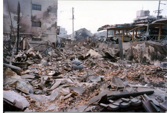
A resident sifts through the burned debris of her former home, Nagata Ward.

Kobe, located in Hyogo Prefecture, is currently the sixth largest city in Japan, with a population of approximately 1.5 million people. The densely built city lies in a valley between several mountains and Osaka Bay. Known as “the International City,” Kobe has long hosted international residents and visitors due to its prominence as a thriving import/export center, having opened its doors to trade with the west in the mid-1800s. Today, the city’s vibrant economy primarily consists of manufacturing, including value goods, shipbuilding, steel, and communication equipment, tourism and hospitality, and fishing. As one of the first Japanese cities to promote western culture, Kobe has become a fashion mecca in Japan and nearby countries.