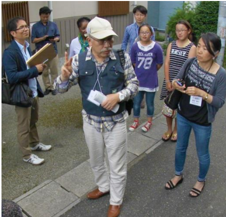
The urban development advisor to Mano-Machizukuri District Council leads a tour of the Mano neighborhood in Kobe.

Because the 1995 Kobe Earthquake devastated so many roadways, the city was left in isolation for days after the first shock. It took many weeks for emergency services from outside the area to successfully infiltrate the city. During that time citizens came to the rescue of their neighbors and set the tone for community-based recovery for the country. Many communities continued to propel their recovery process internally in the medium- and long-term recovery planning as well. The Mano district, an industrial community in Kobe, created the first community-based organization in Japan the 1970s called “machizukuri” (community-based town planning group). A Mano-Machizukuri District Council was formally institutionalized in 1980 and became an integral part of the Mano community when the mayor approved its first planning