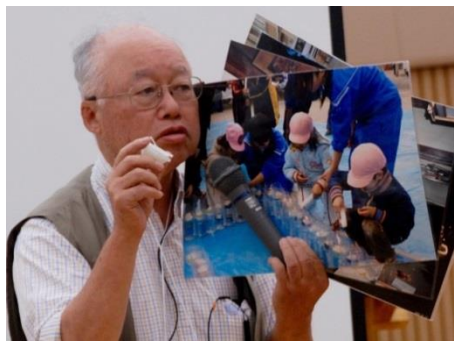
The chief of the Kobe ni Akari wo in Nagata NPO (Let there be Light for Kobe in Nagata) reminds the next generation to be prepared for disasters by working together to build

Machi-Communication proves to be just one of many successful community-based organizations created in response to the 1995 earthquake in Kobe’s Nagata Ward. The Takatori Community Center, located in a Catholic church that was rebuilt by the community after it burned to the ground during the 1995 earthquake, houses 10 such NPOs, including FMYY Radio. In the months following the earthquake, the church site was filled with tents and served as a rescue base for the neighborhood. Those tents acted as shelter for many families for up to 10 years. The community formally rebuilt the site into the Takatori Community Center in 2005. The NPOs that operate out of the community center address a wide array of community needs and range from a multi-language center offering affordable translation services to an empowerment program for women in small businesses to the memorialization of the