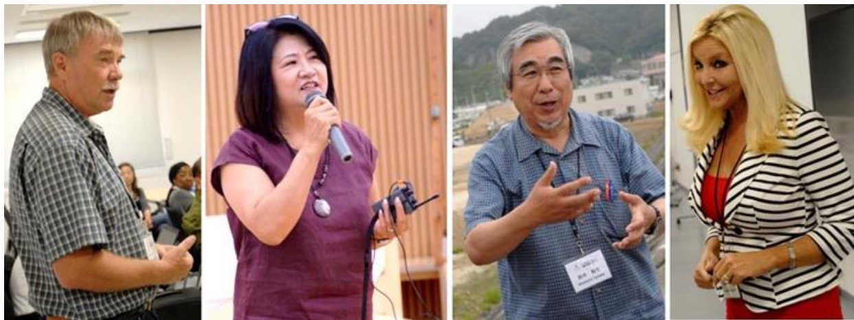
Community leaders from the New Orleans Committee for a Better New Orleans; Takatori Community Center in Kobe; Tarochoan Cooperative Association, Taro District, Miyako City; and Galveston Regional Chamber of Commerce.

Civil society organizations in Japan and the United States can learn much from one another regarding strategies for enhancing citizen engagement, especially in long-term rebuilding efforts following a major disaster.