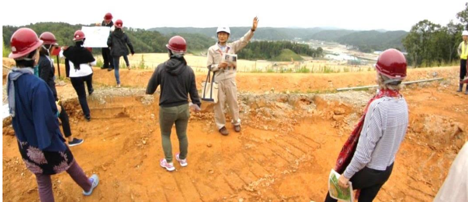
Rebuilding the Taro community on higher ground.