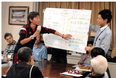
Sharing ideas with members of the Mano District

The creation of a recovery plan outlines the needs of a city, prioritizes reconstruction projects, identifies sources of funding, and establishes trust and credibility with a community. 6 This recovery plan should be created by a neutral party, rather than a government entity, and should incorporate the needs of the community. Housing recovery should be first and foremost in the redevelopment process, 7 as businesses and schools cannot return to a city until