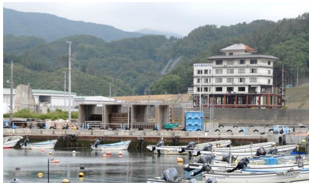
The Taro Kanko Hotel, severely damaged by the tsunami, will become a memorial and a disaster learning facility.

onto the train in order to allow transportation of recovered items to evacuation centers and temporary housing units. Families transported any items they could rescue from their destroyed homes and businesses, including motor scooters, bicycles, furniture, and other personal items that previously were not permitted on the train. Full service was restored to the rail line in April of 2014, an unprecedented recovery time.