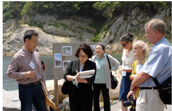
Sharing lessons learned from past disasters with the leader of Aneyoshi Village, Omoe District in Miyako.