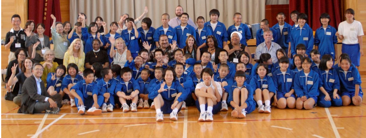
U.S. participants spend time with Miyako's next generation during a visit to Omoe Junior High School.