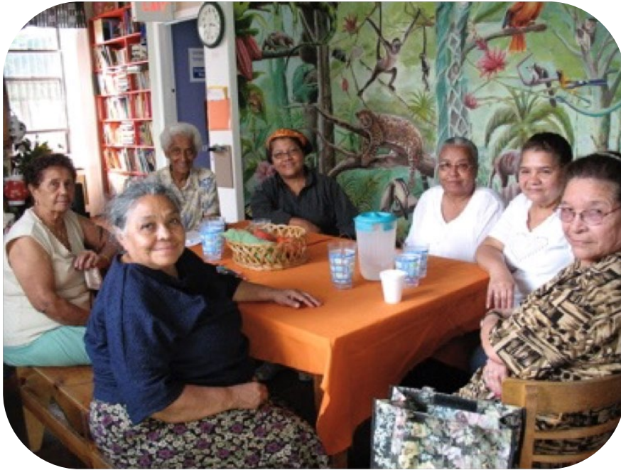
"Las Parcelas & Grupo Motivos Philadelphia." Photograph. Philadelphia, PA. 2000. From presentation, Social and Community Impacts of Urban Agriculture. (Accessed March 21, 2022).