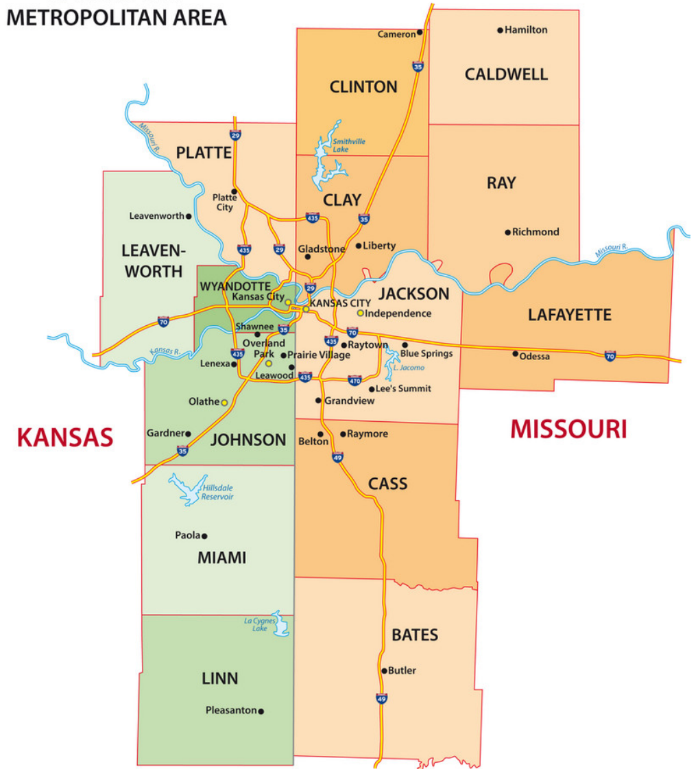
KANSAS CITY METROPOLITAN AREA